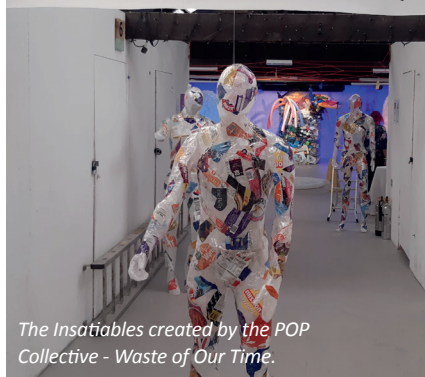
The Insatiabiles created by the POP Collective - Waste of Our Time.

This perky fund, unique to POP, has been running in one form or another since November 2020 funding more than 45 collaborative and unique community projects. From Prince Rock to Plymstock, the Hoe to Glenholt, we have seen the good that happens when organisations work together for the benefit of others.