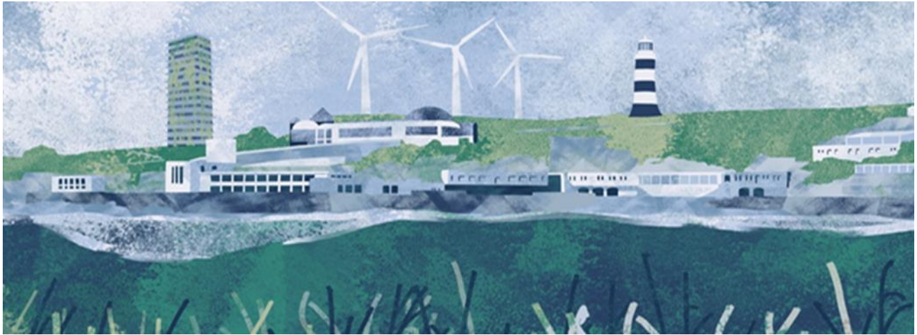
Illustration Joe Meldrum - Plymouth Design